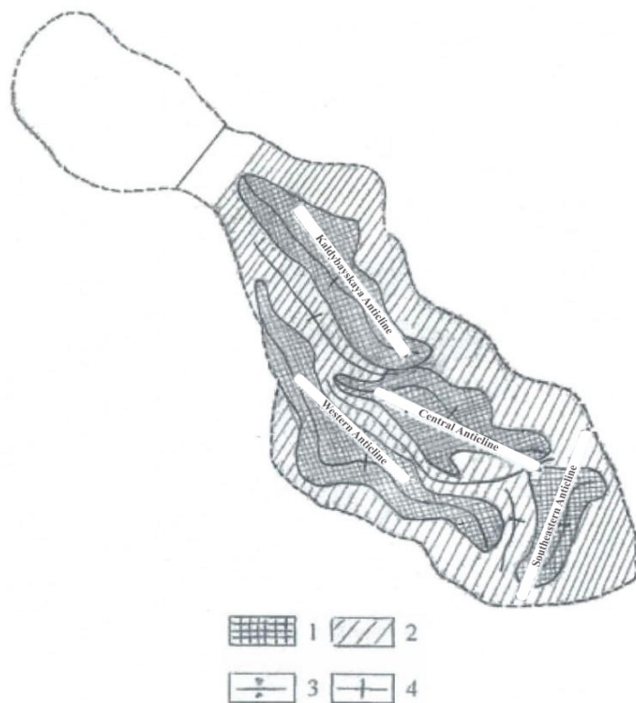
Figure 2. Diagram of the tectonic structure of the dome of the salt dome of Satimola. Scale 1:50000.

1-anticlinal structures; 2-areas of predominantly monoclinic occurrence of salt rocks.